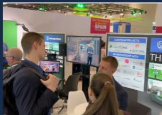
Bett UK 2023