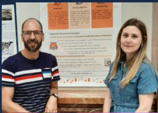
Ethna System final conference